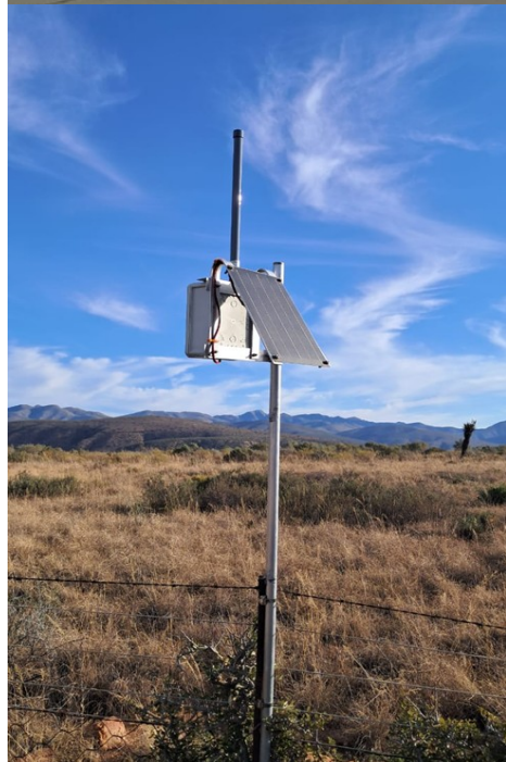
Left: Meshcore repeater deployed at Zandvlakte on the mountain.