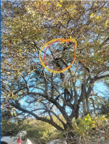
Spot Andrew ZS2G in the tree

The choice of antennas, first a linked dipole for 20, 40 and 80 meters and then a very big dipole erected by Andrew, ZS2G for 160 meters.