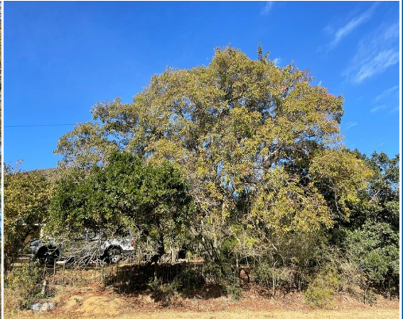
Now try and find the balun for the 160m antenna