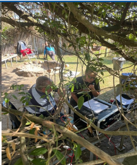
Right: Some operating while the band was hot.....

Thank you to all who made this field day a success. It was certainly one of the more memorable ones, especially with the volume of contacts made.