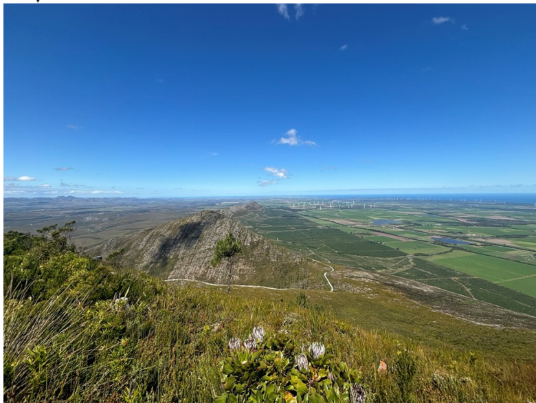
A View From The Kareedouw Berg Repeater Site. See Page

This Newsletter is published by the Port Elizabeth Amateur Radio Society