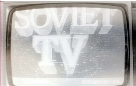
An example of a SSTV image